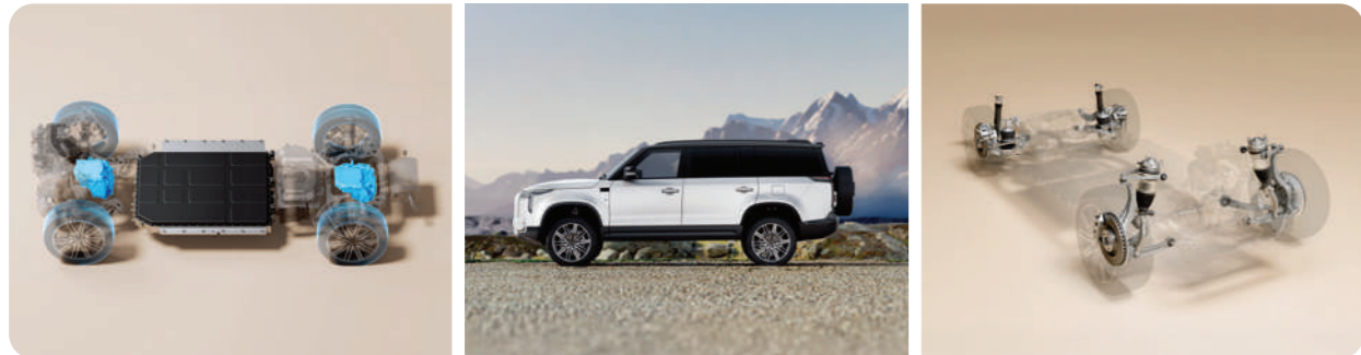
Full-time AWD | 0-100 km/h in 5.5 s | Combined Range WLTC 1226 km | 140 mm Ride-height Adjustment Air Suspension | Dynamic Damping Control | All-aluminum Independent Suspension | Front Double-wishbone and Rear H-arm Multi-link Suspension