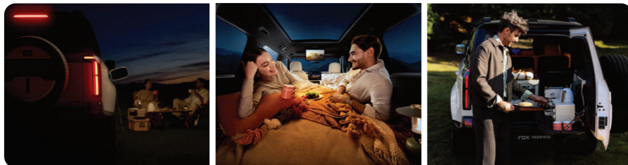
Up to 5.7 kW External Power Output (3.5 kW V2L + 2.2 kW 220V) for Up to 8 Hours | 2nd & 3rd Rows Fold Flat into Bed Space (>7-Seater) | World's First Tailgate Kitchen System