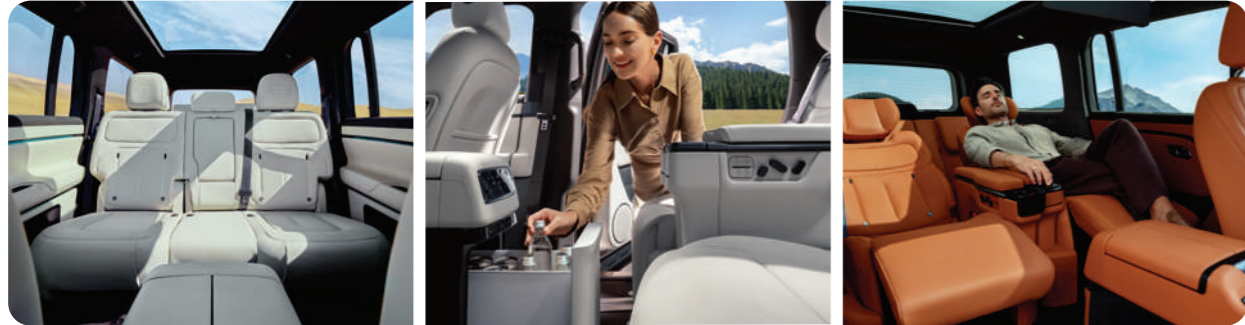
7-Seater (2-3-2): Versatile and Spacious Cabin | 8.5 L Dual-mode Cooler/Warmer | 6-Seater (2-2-2): First-class Zero-gravity Seats