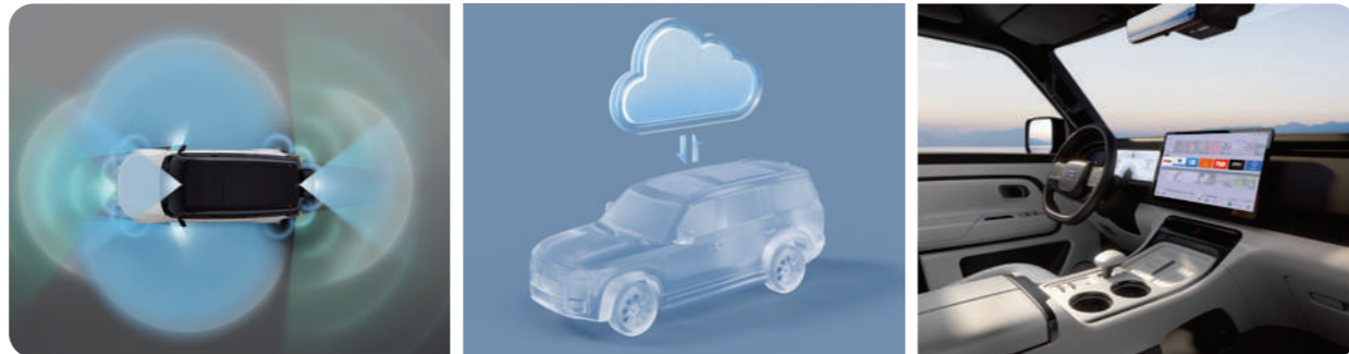
26-Sensor, 128-TOPS Intelligent Driving Assistance System | Wireless Connectivity with OTA Upgrades (Supported in Egypt, Jordan, Kuwait, Oman, Qatar, Saudi Arabia, and UAE) | Extensive Entertainment and Media Apps