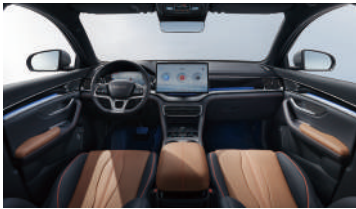
Black and brown