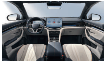
Blue and grey