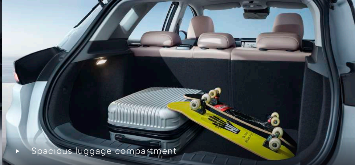
► Spacious luggage compartment