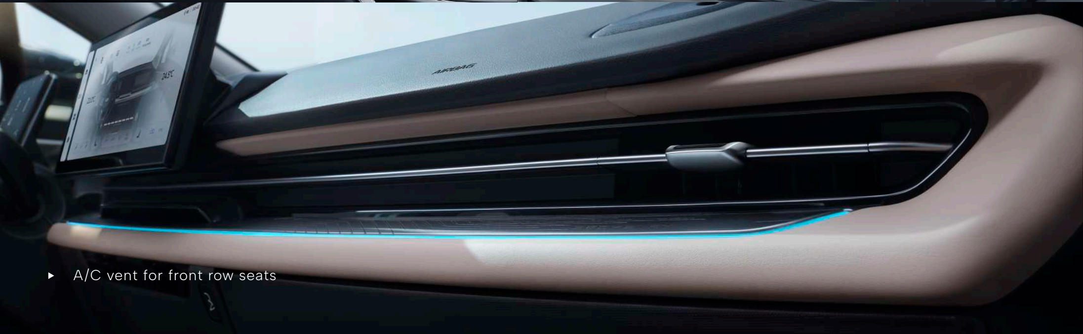
► A/C vent for front row seats