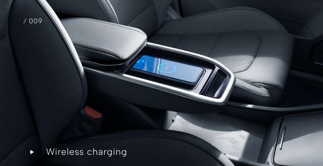
► Wireless charging