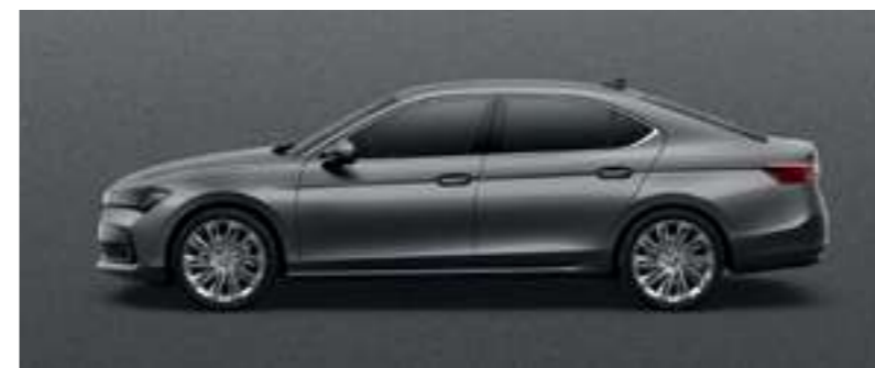
Graphite Grey metallic