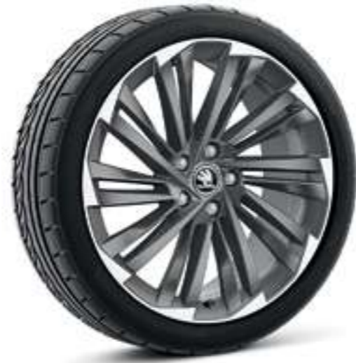
19" Veritate anthracite alloy wheels*