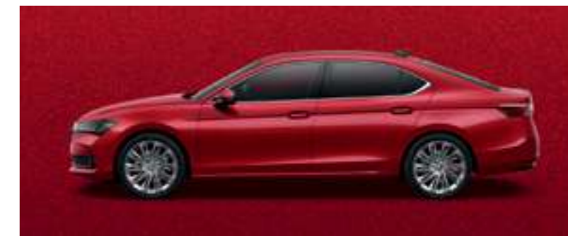
Carmine Red metallic