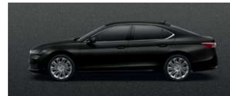
Ebony Black metallic