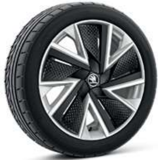
18" Bosona silver alloy wheels with black aero covers