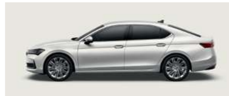
Purity White uni