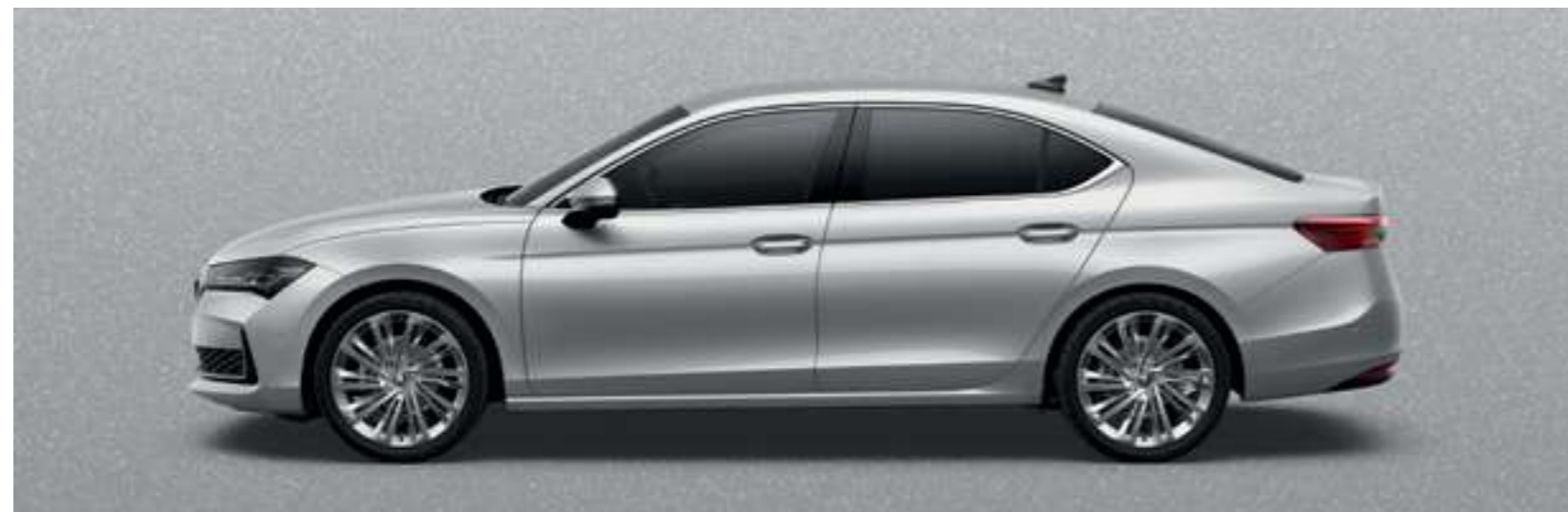
Pebble Silver metallic