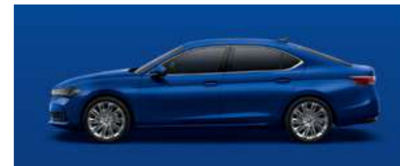
Energy Blue uni