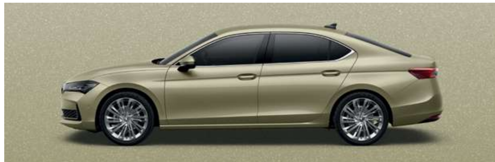
Ice Tea Yellow metallic