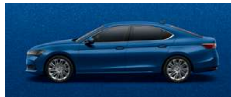
Cobalt Blue metallic